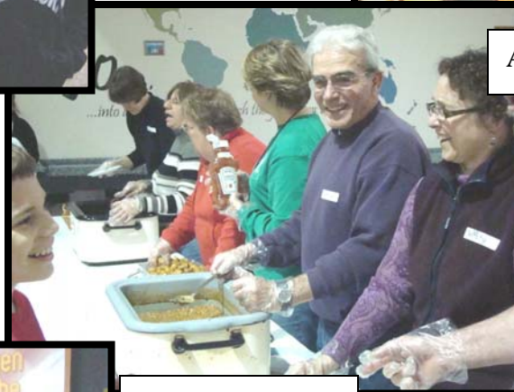
Loving to serve