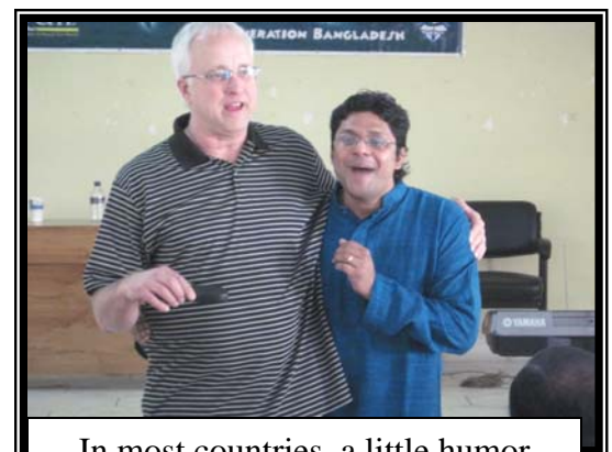
In most countries, a little humor goes a long way as an ambassador.

Who are you representing? Whether we are traveling to foreign lands or across town, people are watching and we are representing others as we go. Our prayer should always be that we would be faithful ambassadors, especially considering we are representing the King of Kings and Lord of Lords.