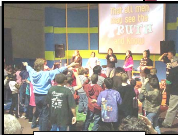
Getting into worship