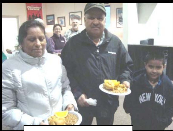
Taking in a good meal

After spending some time overseas, PowerLink is back in action locally, running PowerHouse, our service for kids, the PowerSports basketball program and serving up a good meal to kids and some parents that show up as well.