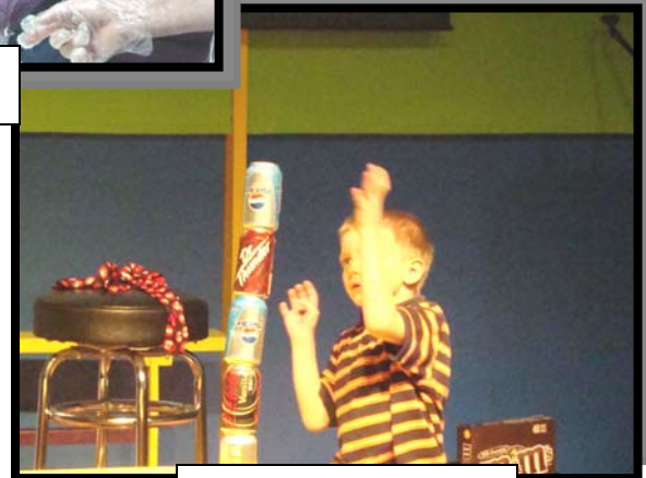
Taking a game break