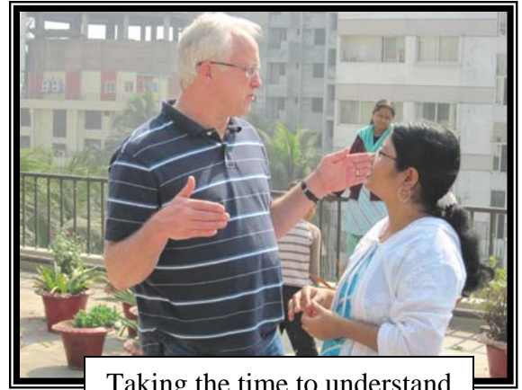
Taking the time to understand a different culture.