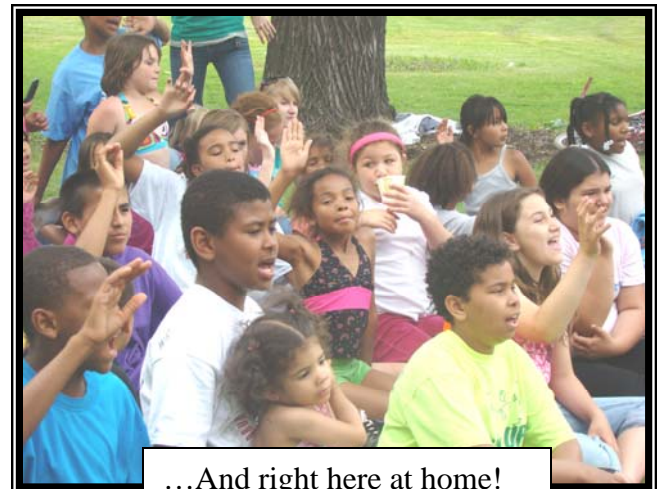
...And right here at home!